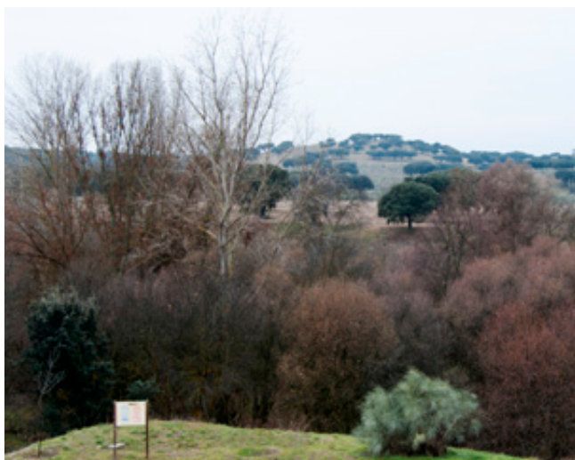
El Pardo game reserve as seen from our first viewpoint

This report covers two days of birdwatching around Madrid, Spain. We visited El Pardo, the hills around Fresno de Torote and Embalse de Santillana by car.