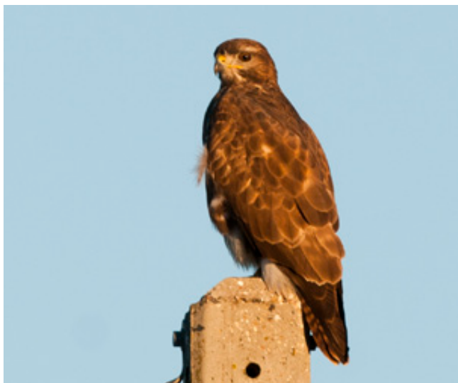
Common Buzzard near Fresno de Torote