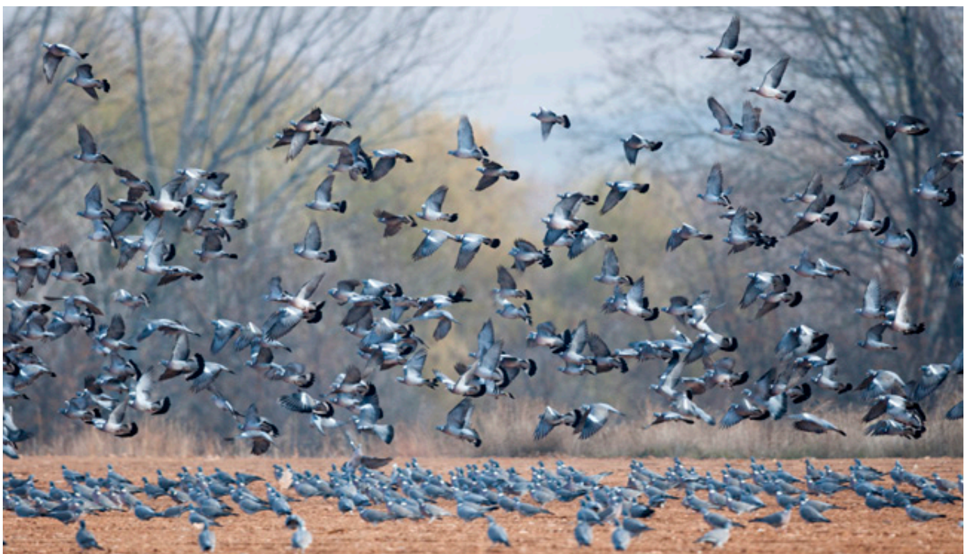
Tiny section of a flock of wintering Wood Pigeons near Reserva Municipal de Azuqueca de Henares

Late in the evening, we visited another spot further north, where an Eagle Owl ( Bubo bubo ) and several Redwings ( Turdus iliacus ) were calling.