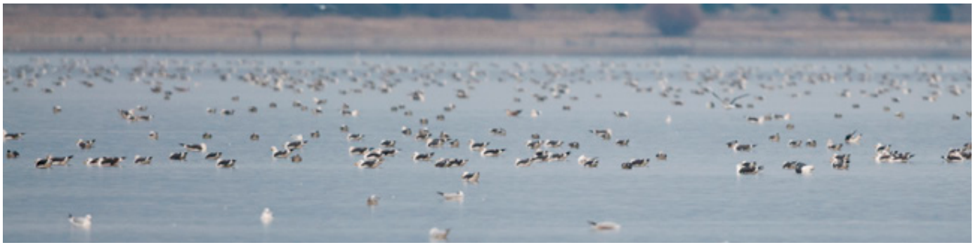
Lesser Black-backed Gulls and Common Black-headed Gulls roosting at Embalse de Santillana.

were astonished to find thousands of Lesser Black-backed Gulls roosting on the lake (with one 3rd calendar-year sporting a white color-ring R:H7T), equally mixed with Common Black-headed Gulls ( Larus ridibundus ). Waterfowl included Black-necked Grebe ( Podiceps nigricollis ), Great Crested Grebe ( Podiceps cristatus ), a male Shoveler ( Anas clypeata ), Gadwall ( Anas strepera ), a female Eurasian Teal ( Anas crecca ), Mallard ( Anas platyrhynchos ) and Coot ( Fulica atra ). White Wagtails ( Motacilla alba ) and eight Common Snipes ( Gallinago gallinago ) frequented the beach and Cetti's Warbler ( Cettia cetti ) was singing.